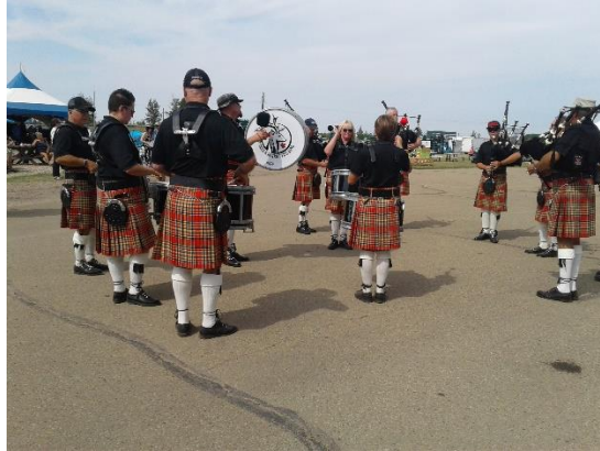
Red Deer & District Pipe Band – female drummer in the middle was twirling her tasselled drum sticks in the air! Pipe bands this year included North Saskatchewan Regimental Pipe and Drums, North Haggis Pipe Band & the above.