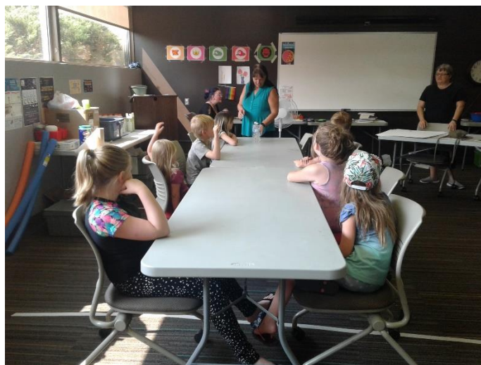
Four more young boys joined us after this picture was taken... a total of about a dozen children attended.